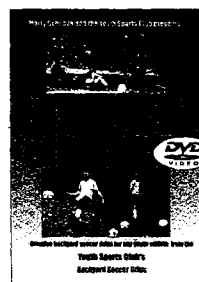
Backyard Soccer Drills $24.95 • ISBN #: 0-9748517-5-2