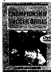
Championship Soccer Drills $24.95 • ISBN #: 0-9671248-5-9