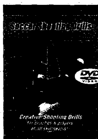
Soccer Shooting Drills $24.95 • ISBN #: 0-9748517-7-9