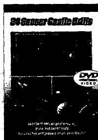
34 Soccer Goalie Drills $24.95 • ISBN #: 0-9748517-8-7